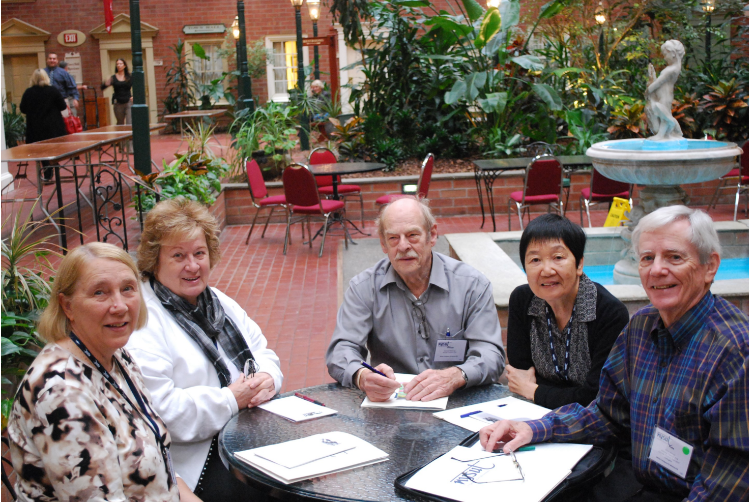
NYSUT RC39 officers working on RC39 issues.